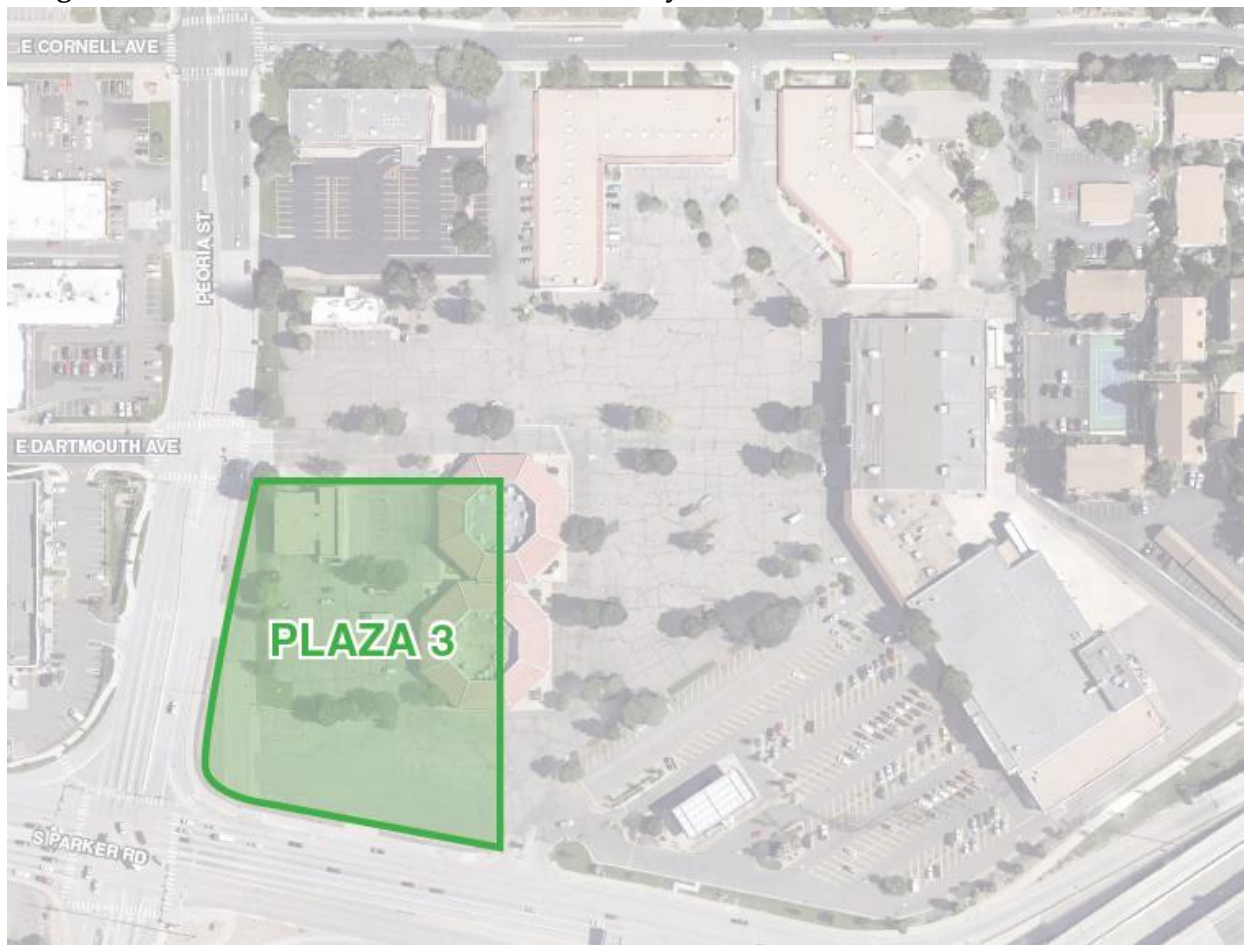
Figure 1. Plaza 3 Urban Renewal Area Boundary