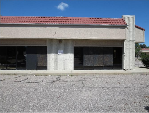
Blight Factor (k.5): Underutilization or Vacancy of Sites/Buildings