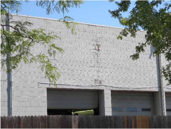
Blight Factor (a): Slum/Deteriorated Structures: Paint/siding deterioration