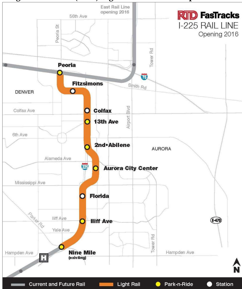
Figure 2. Aurora (I-225) Light Rail Corridor Map