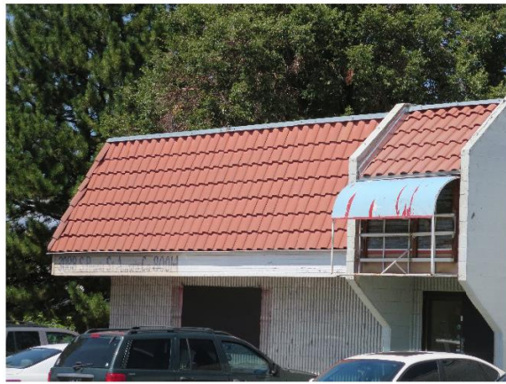
Blight Factor (a): Slum/Deteriorated Structures: Building disrepair