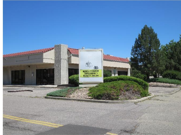
Blight Factor (e): Deterioration of Site or Other Improvements: Poorly maintained signage