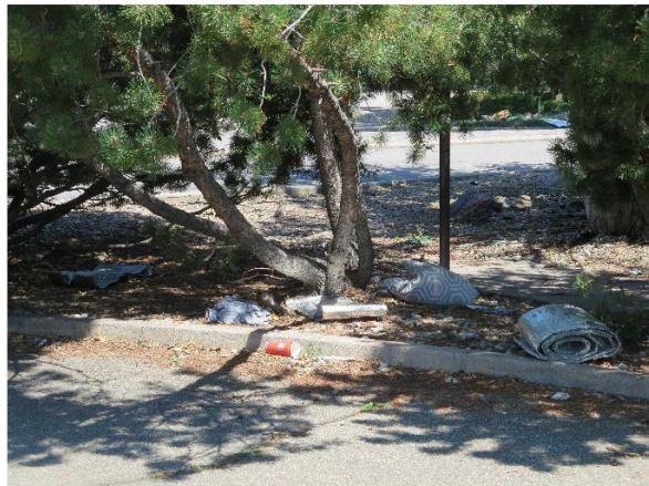
Blight Factor (e): Deterioration of Site or Other Improvements: Trash/Debris