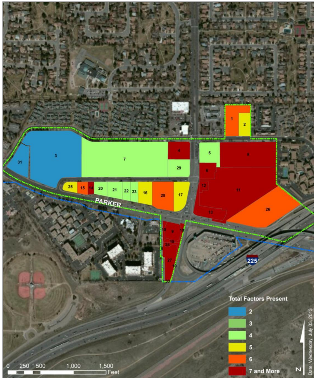
Figure 3. Blight Factor Findings