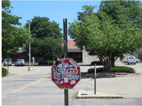
Blight Factor (e): Deterioration of Site or Other Improvements: Deteriorated signage