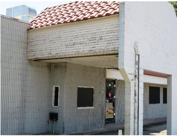
Blight Factor (a): Slum/Deteriorated Structures: Building disrepair