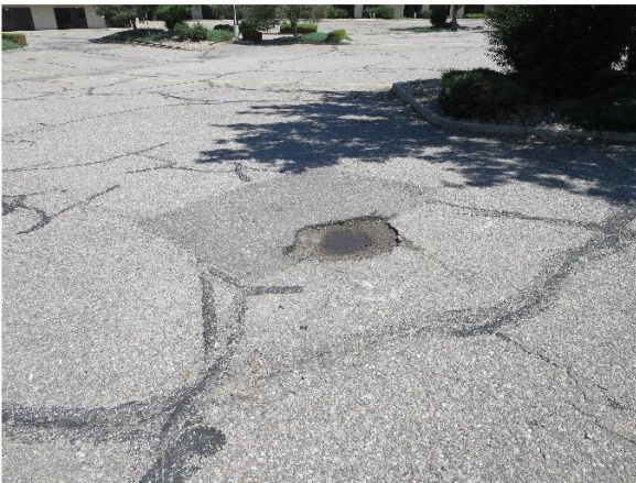
Blight Factor (e): Deterioration of Site or Other Improvements: Deteriorated parking area