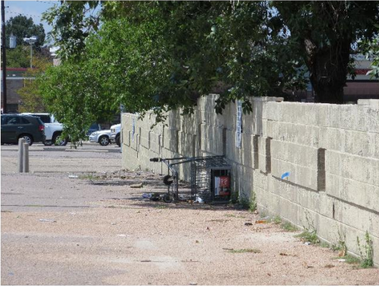
Blight Factor (e): Deterioration of Site or Other Improvements: Damaged wall