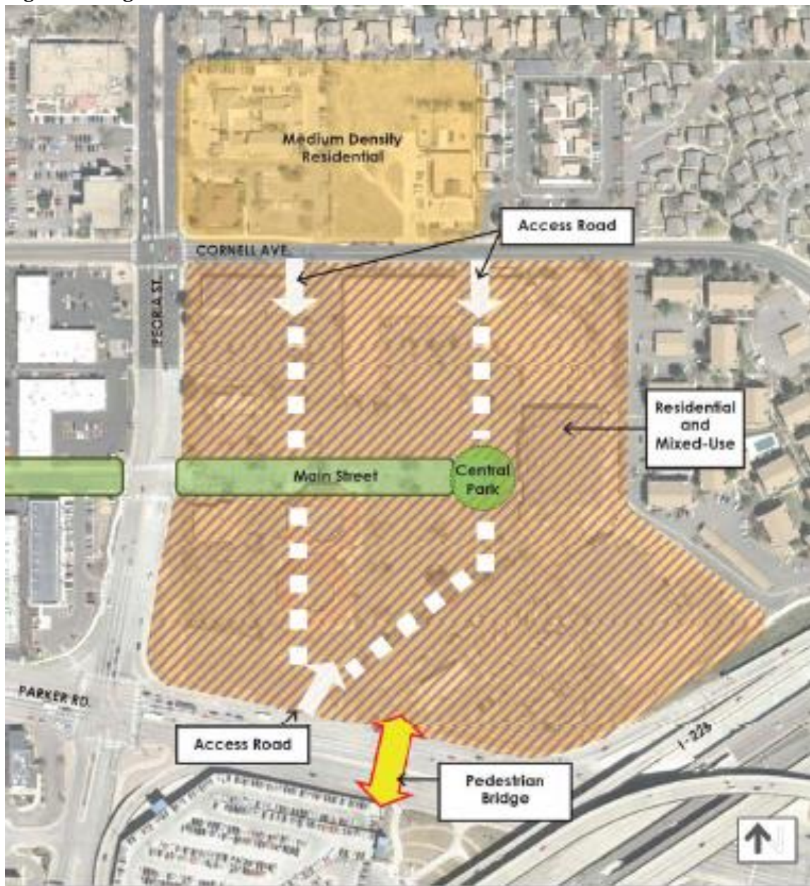
Figure 5. Regatta Plaza Core

Key redevelopment elements of Regatta Plaza include: